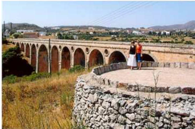
The Katouni Bridge