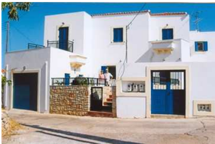
"Our home away from home" in Frilingianika