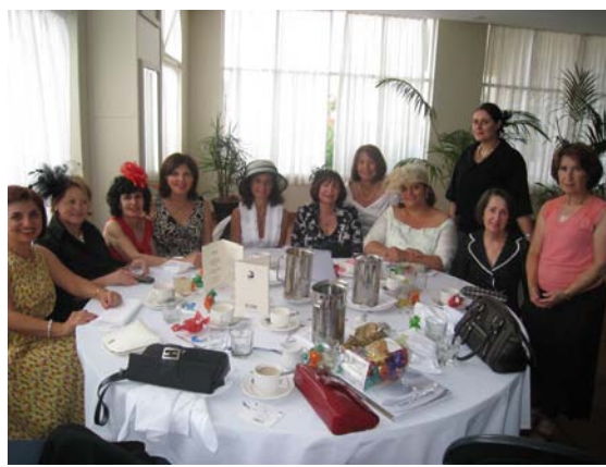
PHOTOS FROM MELBOURNE CUP LUNCHEON 2008