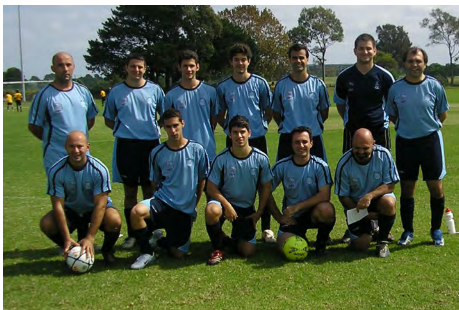
Photo: 2007 Team on the first day of the season