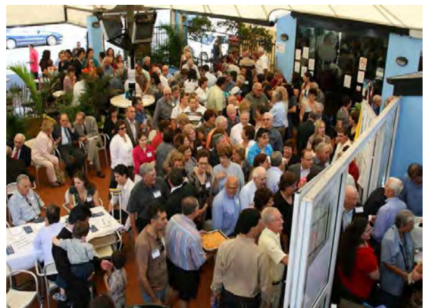
Excess people milling at the entrance to Cyrus Club.