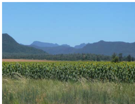
The scenic drive to Sawn Rocks offers stunning views in all directions