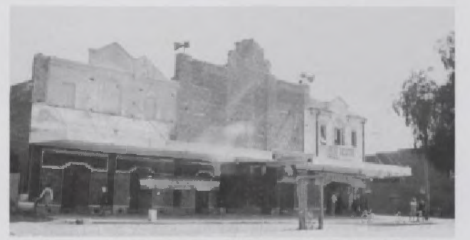
The Roxy's unfinished facade.

The story of The Roxy is not just about the venue, the bricks and mortar. It is not just about the striking art deco architecture or its historical significance. It's a story of big ideas, of dreams and visions against all odds. It's a story of heartbreak and ultimately triumph. It is a story that has touched many lives and in doing so has been well documented over the years.