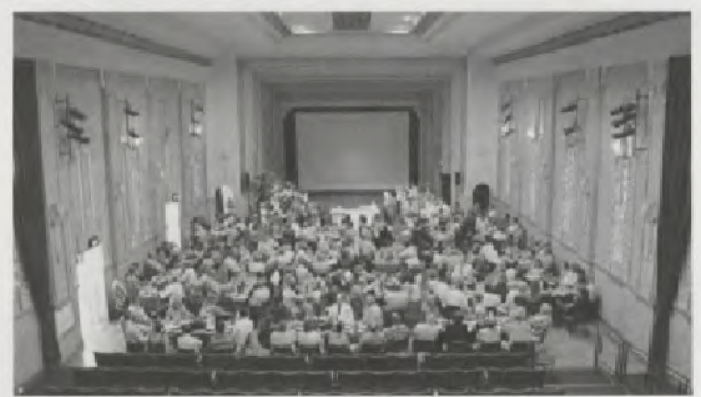
The refurbished Roxy Theatre is a multi-purpose venue and here it is used for a dinner.

The Roxy Café continued operating under a series of Greek owners until the mid-1960s when it became a freehold title and was sold to Bob and Elva Kirk, who opened a memorabilia shop in the café and lived above it in the residence. It then fulfilled a rightful obligation to the town when it masqueraded as a Chinese café for twenty years before being purchased by the Gwydir Shire Council in 2008.