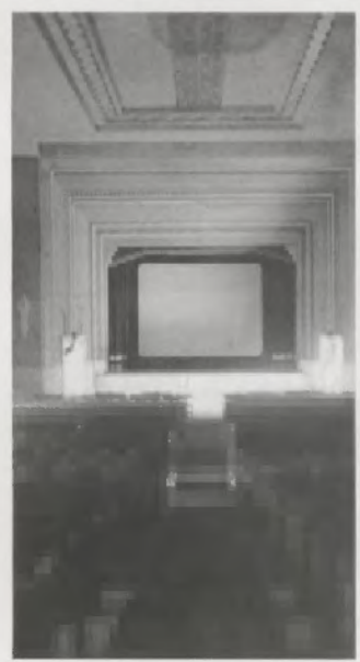
The Roxy interior, one of only two photos known to exist of the original interior.

and refreshment rooms. Those seeking to establish independent enterprises of their own were forced to look further afield. The country towns of New South Wales and southern Queensland embraced these culinary concerns that offered an extensive and affordable array of food, beverages and confectionary to satisfy every pocket and appetite.