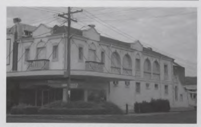
The side of the Roxy Cafe showing the Mediterranean style of architecture.

Peacocke continued to make improvements to his Regent Theatre such as upgrading his sound equipment that became far superior to that of The Roxy. His